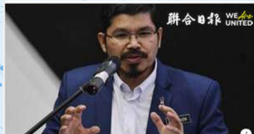
WEAREUNITED.COM.MY 统计局：我国扩大与亚太统计界合作 尤其实施2030年可持续发展议程 葛哈米尼：除了通过大马统计培训学院加强国际合作，我国也为可持续和参与式统计能力...