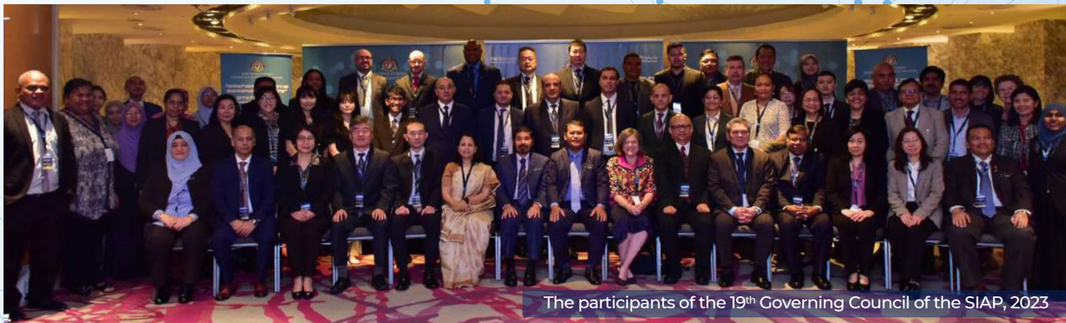
The participants of the 19 th Governing Council of the SIAP, 2023