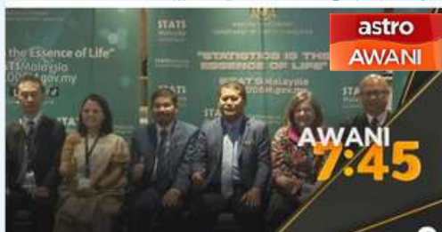
ASTROAWANI.COM Sesi LE-19 GC SIAP: Perluas program statistik dengan komuniti Asia Pasifik Malaysia akan meningkatkan kerjasama di peringkat Asia dan Pasifik untuk memperluas progr...