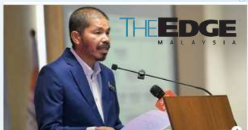
THEEDGEMALAYSIA.COM DOSM: Malaysia expands statistical programmes with Asia-Pacific community KUALA LUMPUR (Dec 13): Malaysia will increase its collaborations with Asia and the Pacific stat...