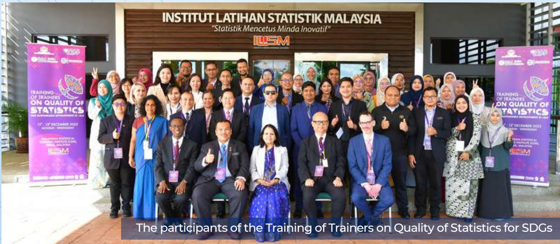
The participants of the Training of Trainers on Quality of Statistics for SDGs

Participants have acquired in-depth knowledge of the core concepts of quality assurance, the United Nations reference national quality assurance framework and the national quality assurance framework (NQAF) implementation. Participants have also been exposed to the quality requirements when using administrative and other data sources, as well as the quality aspects of compiling and disseminating SDG indicators. In addition, this workshop has provided knowledge about the International Monetary Fund's Data Quality Assessment Framework (DQAF) and the enhanced General Data Dissemination System (e-GDDS), which has been enhanced through lectures and hands-on sessions, with the overall goal of strengthening the capacity to produce a set of statistics, including indicators, to track and monitor the SDGs.