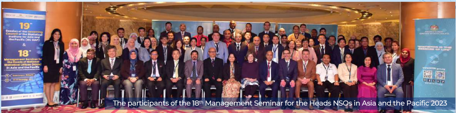
The participants of the 18 th Management Seminar for the Heads NSOs in Asia and the Pacific 2023

The seminar aims to comprehensively assess the implementation of statistical principles in countries, with a focus on addressing challenges and gaps in adherence. It also seeks to explore the adaptability of these principles within federal or devolved governance systems and address issues within international organisations to ensure full compliance. Furthermore, the programme strives to enhance the knowledge of senior statisticians in Asia and the Pacific regarding the application of these principles, empowering them to identify and address areas where implementation may be lacking. Additionally, the programme aims to understand and provide feedback on proposals for an advisory board, focusing on its structure, report and mandate.