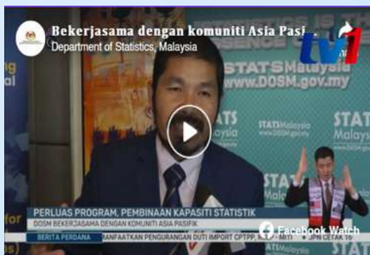
Bekerjasama dengan komuniti Asia Pasi... Department of Statistics, Malaysia