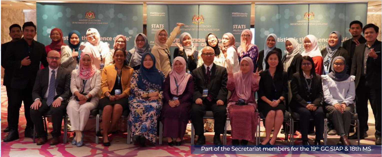
Part of the Secretariat members for the 19 th GC SIAP & 18 th MS

On behalf of Malaysia, DOSM extends heartfelt gratitude to UNSIAP, UNESCAP and UNSD for granting us the honour of hosting the 19 th Session of the Governing Council of the Statistical Institute for Asia and the Pacific and the 18 th Management Seminar for the Heads of National Statistical Offices in Asia and the Pacific: Fundamental Principles of Official Statistics (FPOS) in the city of Kuala Lumpur. Additionally, we hosted the Regional Training of Trainers on Quality of Statistics for Sustainable Development Goals (SDGs) in Sungkai, Perak. These three events were a testament to our unwavering dedication to fostering global cooperation and advancing the field of statistics.