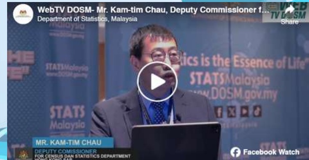
Mr. Kam-tim Chau Deputy Commissioner for the Census and Statistics Department, The Census and Statistics Department of Hong Kong SAR