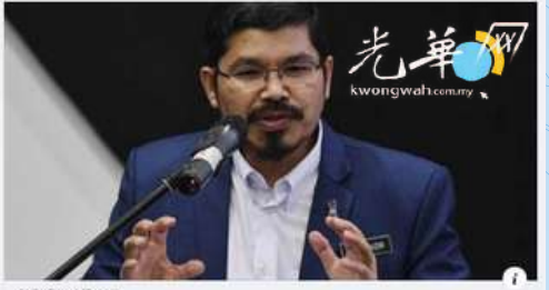
KWONGWAH.COM.MY 统计局：我国扩大与亚太统计界合作 尤其实施2030年可持续发展议程 洗华网 大马进一步加强与亚太统计界合作，以扩大统计能力建设计划活动，尤其是在实施和监督2030...