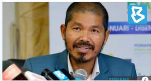
BERNAMA.COM DOSM: MALAYSIA PERLUASKAN PROGRAM STATISTIK DENGAN KOMUNITI ASIA PASIFIK