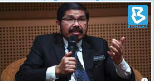
BERNAMA.COM 统计局：我国扩大与亚太统计界合作 统计局：我国扩大与亚太统计界合作