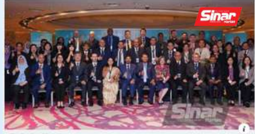
SINARNEWS.COM.MY Mesyuarat GC SIAP ke-19 fokus isu statistik, pelan strategik menjelang 2025-2029 KUALA LUMPUR - Jabatan Perangkaan Malaysia (DOSM) dan Kementerian Ekonomi mengadakan...