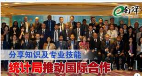
ENANYANG.MY 分享知识及专业技能 统计局推动国际合作 国家首席统计师李智理在吉隆坡与亚太统计界交流，大马将进一步加强与亚太统计界合作，以...