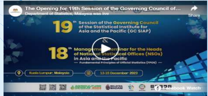
Facebook Live during Opening Session