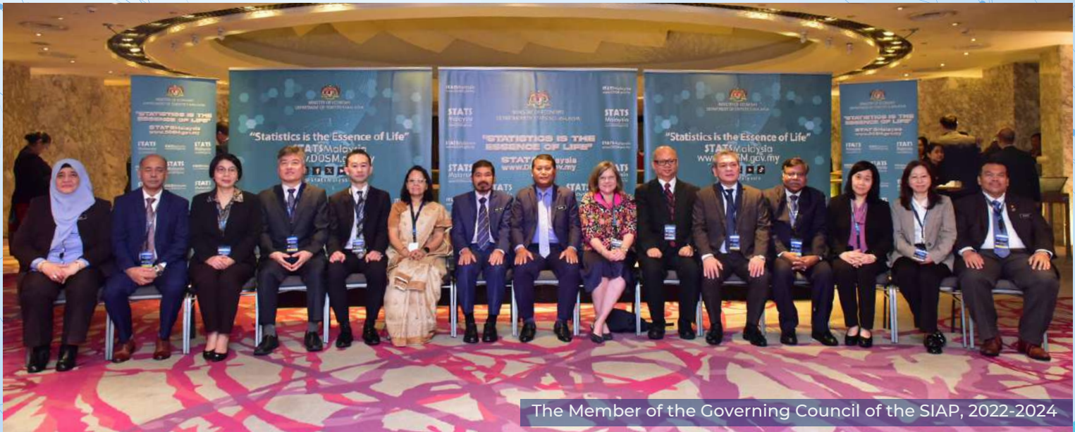
The Member of the Governing Council of the SIAP, 2022-2024

GC will convene annually to assess and improve the governance, administrative and financial status of the UNSIAP. Additionally, they will evaluate, adopt and implement UNSIAP's short-term and long-term annual programmes and activities that will benefit the member countries of the Asia Pacific region, aligning with UNSIAP's Strategic Plan for 2021-2025. The ESCAP Executive Secretary will present the report of the GC meeting to the ESCAP Commission during its yearly session.