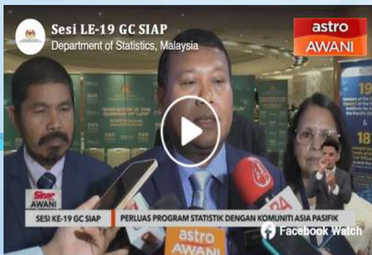
Sesi LE-19 GC SIAP Department of Statistics, Malaysia