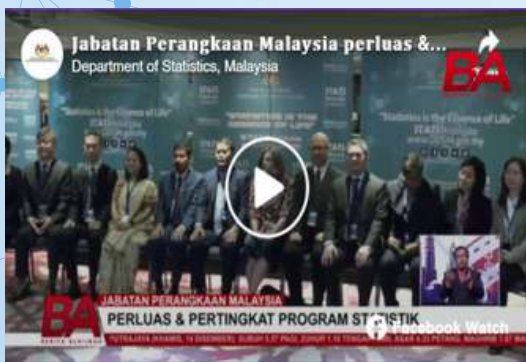
Jabatan Perangkaan Malaysia perluas &... Department of Statistics, Malaysia