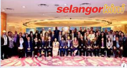
SELANGORKINI.MY 统计局：我国扩大与亚太统计界合作 - Selangorkini 中文 (吉隆坡13日讯) 大马将进一步加强与亚太统计界合作，以扩大统计能力建设计划活动，尤其是...