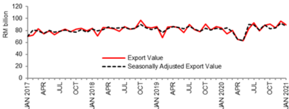
Chart 2: Export Value and Seasonally Adjusted Export Value, RM billion