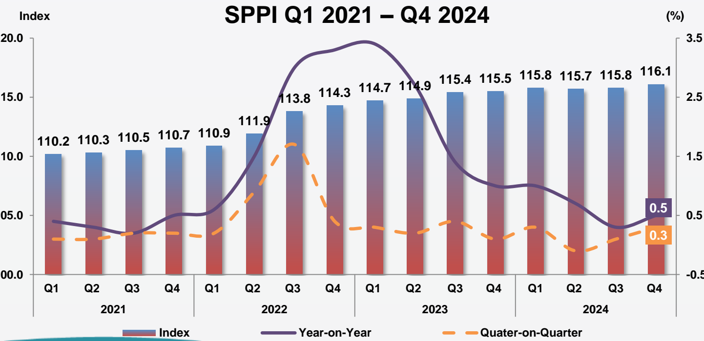
SPPI 2011 - 2024